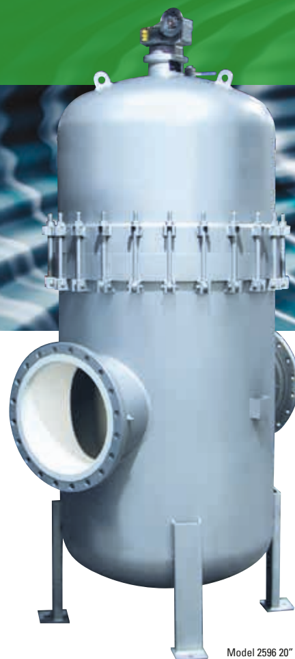
Model 2596 20"

Eaton's Model 2596 Fabricated Automatic Self-Cleaning Pipeline Strainers are available in 10", 12", 14", 16", 18", 20", 24", 30", 36", 48", and 60" sizes. Continuous flow, simplified maintenance, and worry-free operation characterize the Model 2596 across numerous industries.